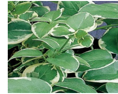
H: 4" Vinca Vine (purchase in quantities of 3)