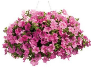
A: 10" Sun Basket: Trailing Petunias for sunny areas