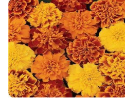
F: 4 Pack Flat of Marigolds Flat (Sometimes referred to as a bed)