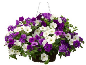
C: 10" Sun Basket: Mixed Annuals for sunny areas