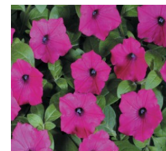
K: 4" Trailing Petunia: various colors (purchase in quantities of 3)