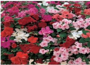
D: 4 Pack Flat of Impatiens Flat (Sometimes referred to as a bed)