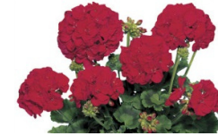
G: 4" Red Geraniums (purchase in quantities of 3)