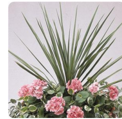
I: 4" Spikes (purchase in quantities of 3)