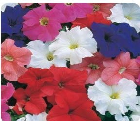
E: 4 Pack Flat of Petunias Flat (Sometimes referred to as a bed)