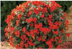
B: 10" Shade Basket: Impatiens for shady areas