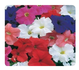
E: 4 Pack Flat of Petunias Flat (Sometimes referred to as a bed)