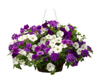
C: 10" Sun Basket: Mixed Annuals for sunny areas